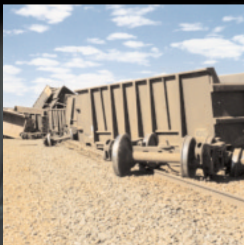
There is no such thing as a cheap derailment!