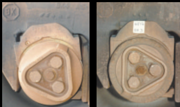
A cocked bearing adaptor (left) due to wear caused by excessive vehicle response